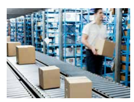
Manual Postal sorting